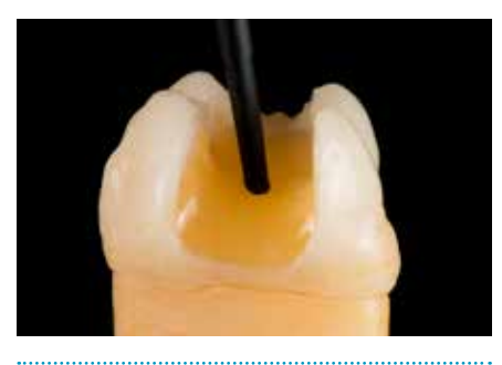
The material keeps its shape during placement (top), but flows when it undergoes shear stress or 'disturbance' (bottom).