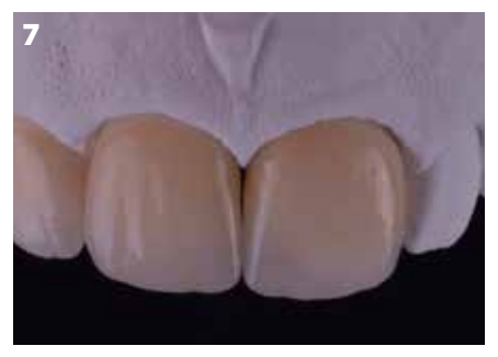
Fig. 7: After glazing

The new Initial IQ ONE SQIN concept enables to maintain the expected quality standards both in terms of time and aesthetic result. In addition, it has been found that the production process could be optimized with these ceramics; the same material can be used on the new generation of metal- free substructures, such as zirconia and lithium disilicate for both painting of monolithics and microlayering; meanwhile, it gives the restorations a fluorescence similar to that of natural teeth, making the restorations truly unnoticeable (Fig. 11).