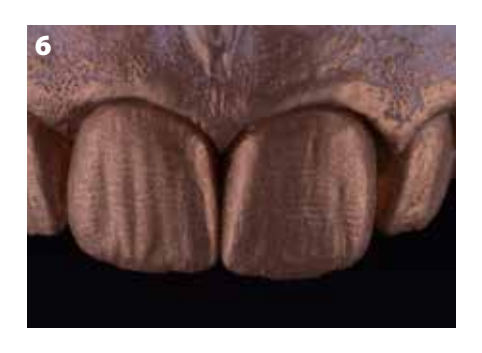
Fig. 6: Verification of the anatomical shape and superficial texture.

The SQIN gives the final texture to the restoration (Fig. 6). After the final firing, a self-glaze effect (Fig. 7) is easily obtained. In blacklight, it can be seen that the fluorescence of the restoration is increased (Fig. 8). Before the final cementation in the mouth with G-CEM Veneer (GC; Shade A2), the restorations were tried in with a glycerine-based paste (G-CEM Try-In Paste; Fig. 9). The cemented restorations gave excellent results, both from a functional and aesthetic point of view, giving back the beauty of the patient's young smile (Fig. 10). The patient was fully satisfied with the results obtained.