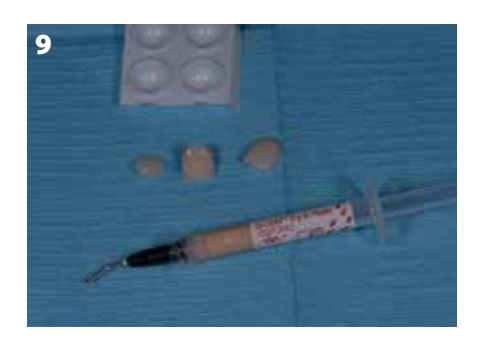
Fig. 9: Try-in with G-CEM Try-In Paste.