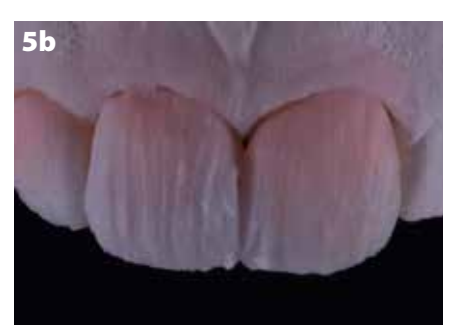
Fig. 5: Initial IQ ONE SQIN concept (a) Initial Lustre Pastes ONE (b) SQIN.