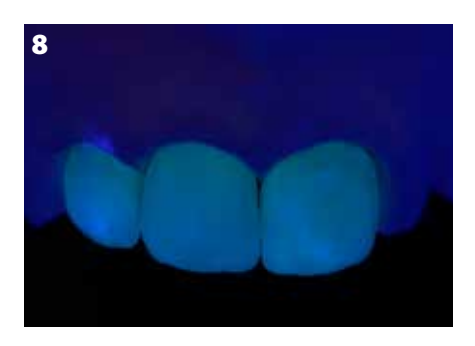
Fig. 8: Verification of the fluorescence on the model.